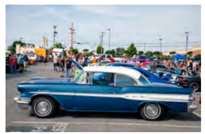
Cars & Coffee Lynchburg in Lynchburg, Virginia. 1956 Pontiac Canon 5D Mark IV, 24-105L at 50mm, ISO 100, F6.3 at 1/500 sec.