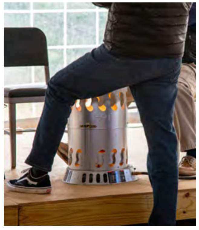
Chestnuts roasting on an open fire. Canon 5D Mark IV, 24-105L at 105 \mathrm{mm} , ISO 200, F6.3 at 1/30 \mathrm{sec} .