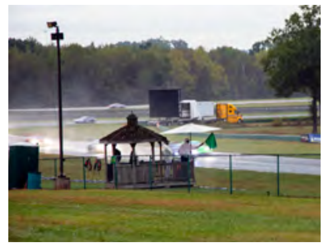
The corner worker at turn 4 displays the green flag at the start of Saturday morning qualifying in the rain. Canon 5D Mark IV, 24-105L at 105mm, ISO 500, F5.6 at 1/125sec.

Early Saturday morning there was a moderate mist falling at Virginia International Raceway. Just before Porsche Carrera Cup qualifying began, a steady rain started and lasted about 90 minutes. Track conditions were very slick and there were several off-track events resulting in several caution flags and a reduction in qualifying time.