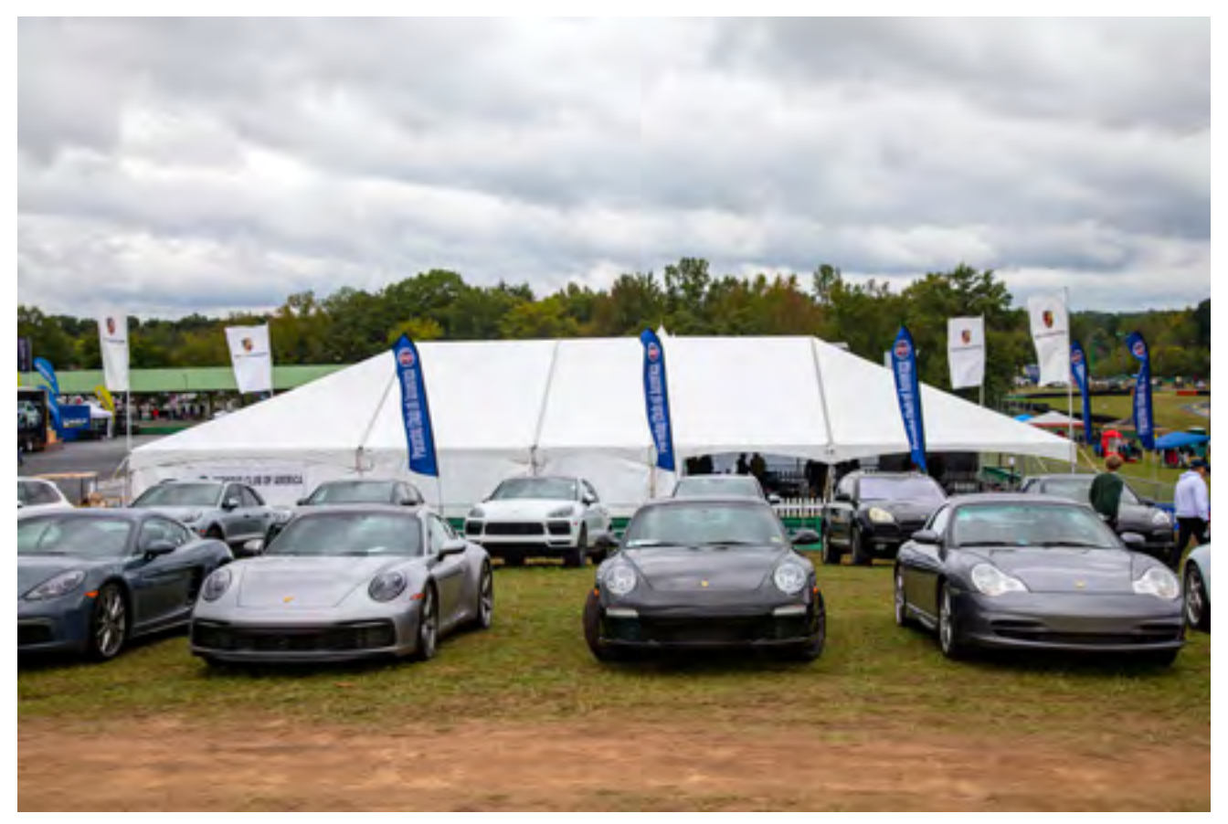
Some of the cars in the Porsche Corral in front of the Hospitality Tent at Virginia International Raceway. Canon 5D Mark IV, 24-105L at 40mm, ISO 200, F7.1 at 1/400 sec.