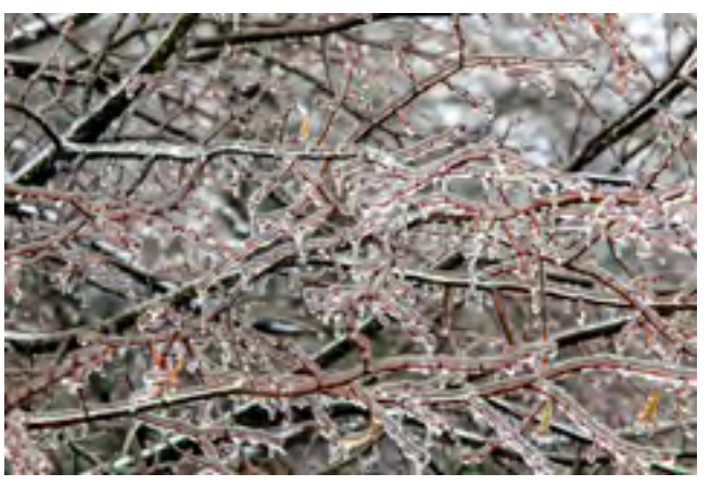
Close-up of ice in a linden tree. Canon 5D Mark IV, 70-200L at 200mm, ISO 200, F10 at 1/160~{\rm sec.}

around. You may see several perspectives, each entirely different from the others. Look for the shot everyone else does not see in their haste. Wait for the best time even it means getting out early or staying out late. Nature offers much to see and photograph.