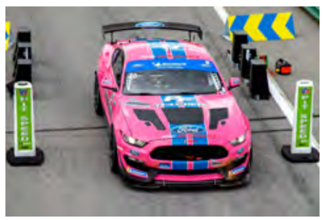
The #40 PF Racing Ford Mustang GT4 leaves the pits and heads back onto the track. Canon 5D Mark IV, 24-105L at 105mm, ISO 200, F7.1 at 1/250 sec.