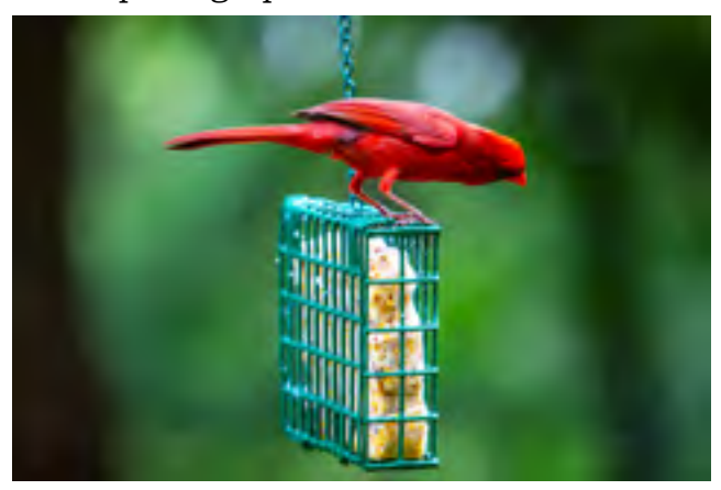
This cardinal tries to figure out how to get the suet. Trail camera photo.

I do not often photograph animals. While they make great photographs, my time is used on other endeavours. I do have photographs of buffalo in Virginia, birds, and my neighbor's horse. But I seldom set out to photograph an animal.