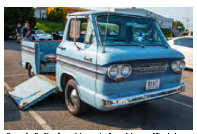
Cars & Coffee Lynchburg in Lynchburg, Virginia. Chevrolet Corvair Rampside Canon 5D Mark IV, 24-105L at 32mm, ISO 200, F9 at 1/200 sec.