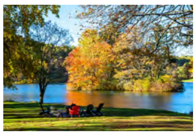
Fire pit and chairs beside Abbott Lake, Peaks of Otter, VA. Canon 5D Mark IV, 24-105L at 55mm, ISO 200, F9 at 1/100 sec.