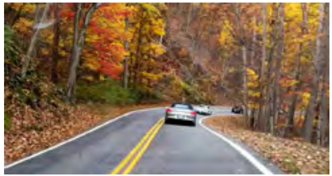
Fall leaves in full color graced out trip north.

detracted from the viewing only slightly. There were plenty of curves to be safely fun, and not get the heart rate too high. Watching for deer was also important this time of year. Several were seen at the edge of various highways likely hit by vehicles. Stay alert!