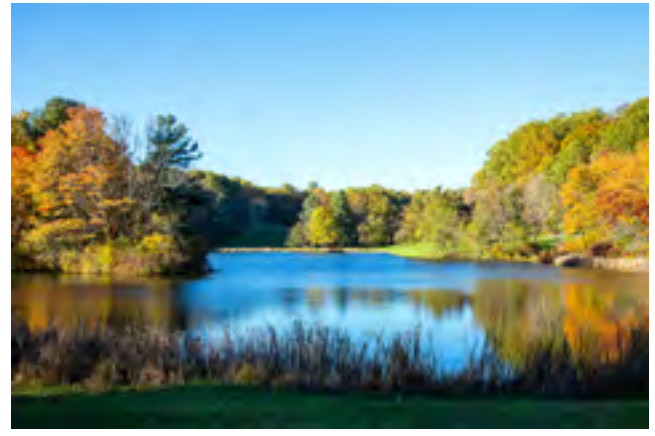
Abbott Lake, Peaks of Otter, VA. Canon 5D Mark IV, 24-105L at 40mm, ISO 200, F9 at 1/250 sec.