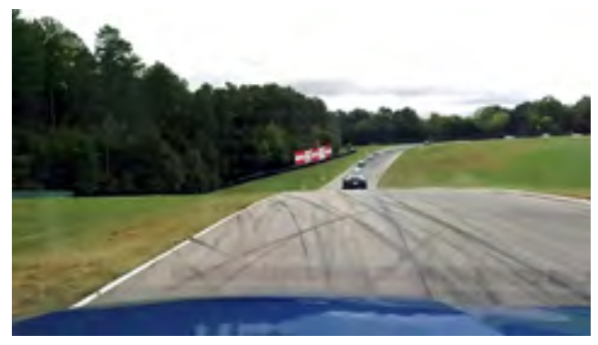
The Back Straight at Virginia International Raceway. Garmin VIRB camera

Safely driving at highway speeds, parade laps give drivers a better perspective on the technical parts of driving in competition. Following the racing line through the turns helps fans understand some of the nuances of racing.