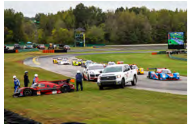
The #47 Forty7 Motorsports LMP3 Prototype goes off track and needs to be pulled back to resume racing. Canon 5D Mark IV, 24-105L at 105mm, ISO 400, F7.1 at 1/320 sec.