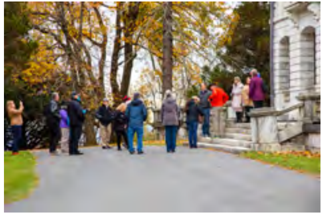
Some of our group getting ready to tour inside the house. Canon 5D Mark IV, 24-105L at 92mm, ISO 200, F6.3 at 1/200 sec.