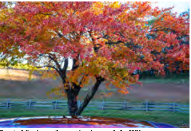
Tree in fall colors reflect on the glass roof of a SUV. Canon 5D Mark IV, 24-105L at 67mm, ISO 200, F9 at 1/20 sec.