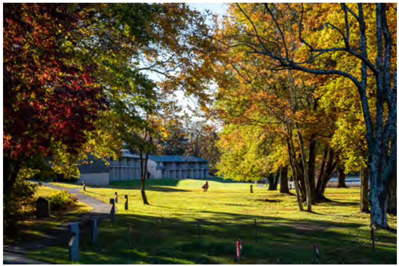
The lodge rooms at Peaks of Otter with Abbott Lake views. Below, views of Abbott Lake, Peaks of Otter, VA. Canon 5D Mark IV, 24-105L at 32mm, ISO 200, F9 at 1/100 sec.