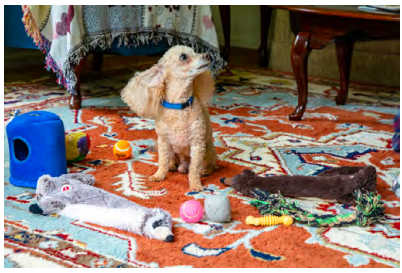
But Mama, do I have to pick up ALL my toys? At least that is what he seems to be asking. Canon 5D Mark IV, 24-105L at 67mm, ISO 200, F7.1 at 1/15 sec.