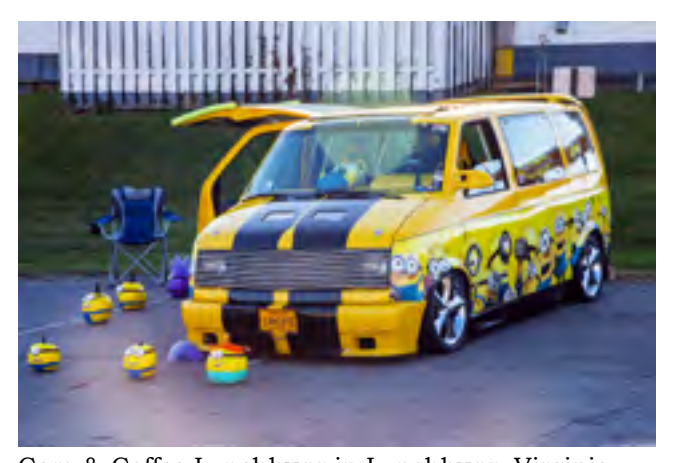
Cars & Coffee Lynchburg in Lynchburg, Virginia. Van decorated with Minions. Canon 5D Mark IV, 24-105L at 80mm, ISO 100, F9 at 1/60 sec.