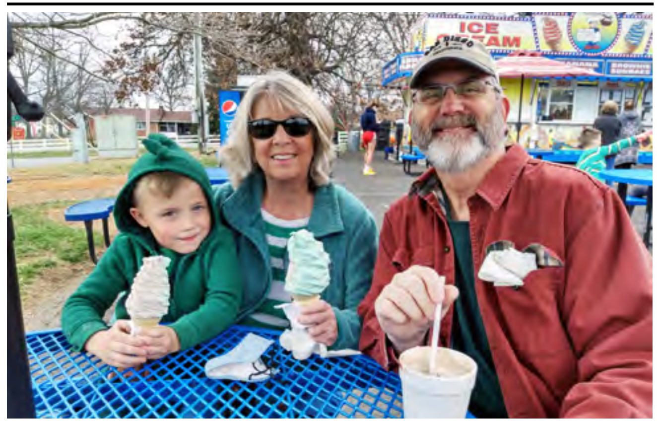
L-R: My great nephew, sister-in-law, and brother. Family is very important to me.

I hope you enjoy the variety in this issue. In the future I will publish an annual issue for your enjoyment.