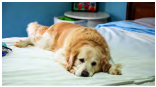
My neighbor's dog came for a visit and made himself at home. Canon 5D Mark IV, 24-105L at 95mm, ISO 5000, F4.5 at 1/80 sec.