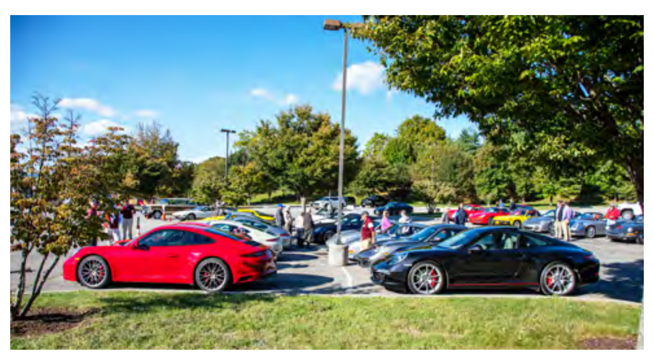
The local Porsche club event in Salem, Virginia. Canon 5D Mark IV, 24-105L at 24mm, ISO 100, F7.1 at 1/200 sec.