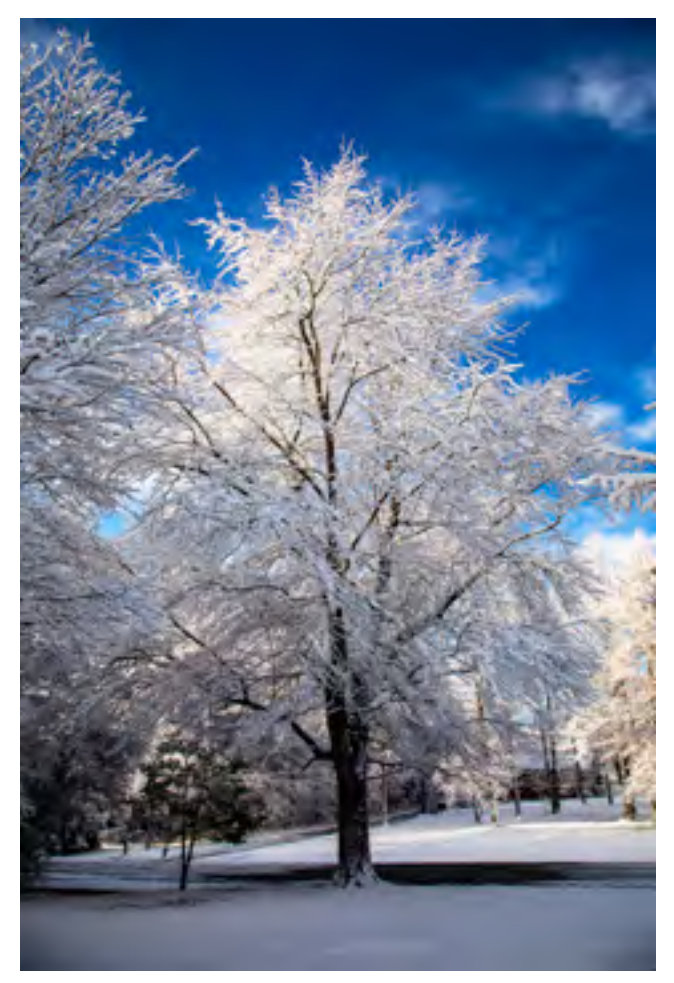
Sun shines on an ice glazed maple tree. Canon 5D Mark IV, 24-105L at 24mm, ISO 200, F11 at 1/500 sec.

Winter weather is cold, dark, and ugly. That is until there is snow or ice around. Sparkling ice, snow falling, and sunshine create many beautiful photographs. The opportunities are endless for creativity and different perspectives. Take time to look