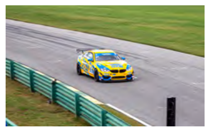
The #96 Turner Motorsport BMW M4 GT4 passes under the start stand. Canon 5D Mark IV, 24-105L at 400mm, ISO 200, F7.1 at 1/250 sec.

During the race there an incident on the track which brought out the full course caution. Photos of the starter are not often seen from that perspective. As the cars slowed, there was a better photo opportunity due to the lower speed. Workers there are constantly alert to changing track conditions.