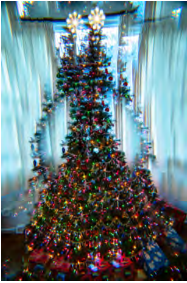
Christmas tree, the filter was centered in the ring. Canon 5D Mark IV, 24-105L at 65mm, ISO 250, F4.5 at 1/125 sec.