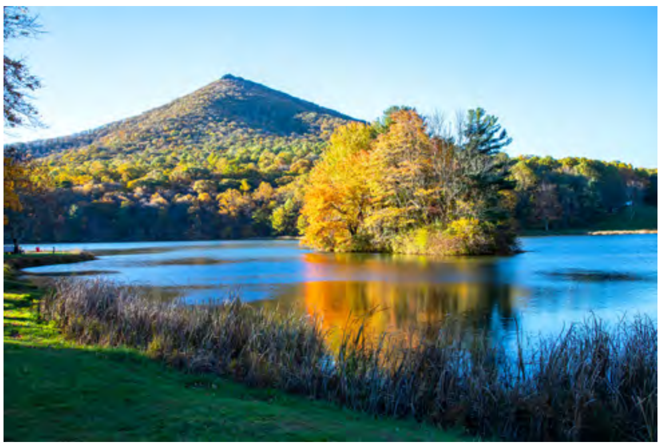
Sharp Top across Abbott Lake from the Peaks of Otter Lodge registration and restaurant building. Canon 5D Mark IV, 24-105L at 32mm, ISO 200, F9 at 1/100 sec.

Abbott Lake is a 24-acre impoundment located along the scenic Blue Ridge Parkway in Bedford County and part of the Peaks of Otter Park. Fishing, hikes, and picnics are part of the park.