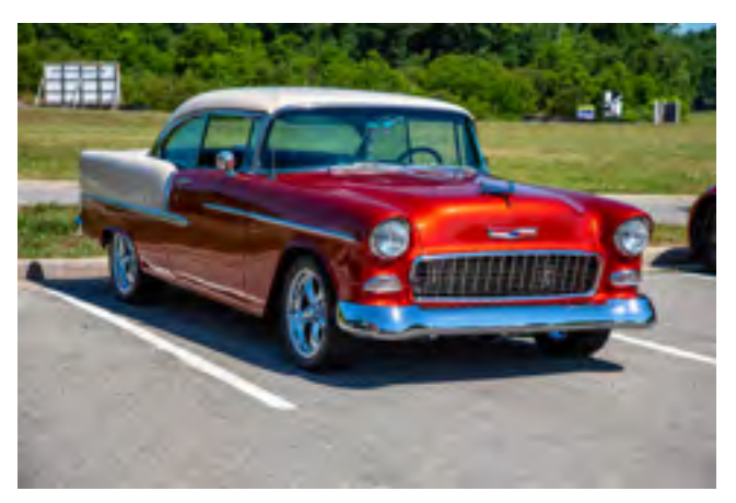
Lake Pipes cruise-in Moneta, Virginia. 1955 Chevrolet Canon 5D Mark IV, 24-105L at 84mm, ISO 200, F6.3 at 1/640 sec.