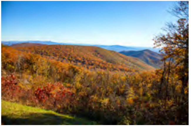
Fall colors from an overlook on, Blue Ridge Parkway, VA. Canon 5D Mark IV, 24-105L at 24mm, ISO 200, F9 at 1/200 sec.