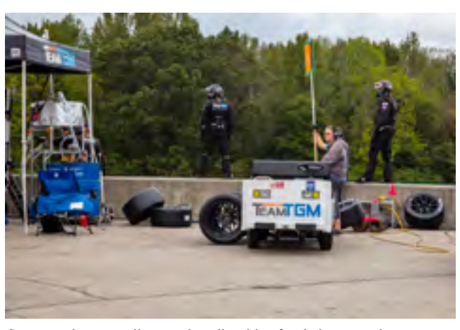
Crew members standing on pit wall waiting for their car to pit. Canon 5D Mark IV, 24-105L at 70mm, ISO 200, F7.1 at 1/200~{\rm sec.}