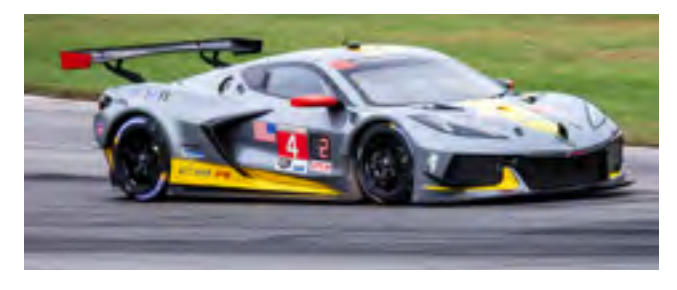
The GTLM class winning #4 Corvette Racing Corvette. Canon 5D Mark IV, 100-400L at 275mm, ISO 200, F7.1 at 1/500 sec.

The main event, the Michelin GT Challenge was run with the GTLM Corvettes finishing 1-2, and the Weather Tech Porsche 3rd. While the Corvettes and Porsche shared some paint, it was the off-track event for the Weather Tech Porsche that sealed its finishing spot.