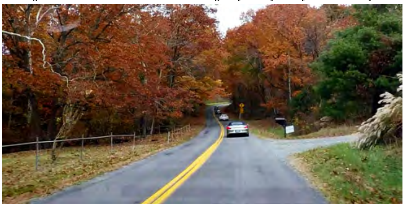
Fall leaves in full color graced our trip north. The lower elevations were near peak color, the higher elevations were way past peak color. Garmin VIRB

detracted from the viewing only slightly. There were plenty of curves to be safely fun, and not get the heart rate too high. Watching for deer was also important this time of year. Several were seen at the edge of various highways likely hit by vehicles. Stay alert!