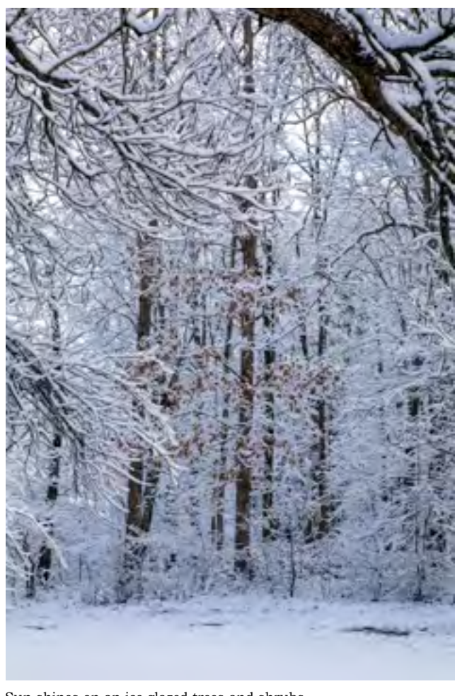
Sun shines on an ice glazed trees and shrubs Canon 5D Mark IV, 24-105L at 75mm, ISO 200, F11 at 1/250 sec.

around. You may see several perspectives, each entirely different from the others. Look for the shot everyone else does not see in their haste. Wait for the best time even it means getting out early or staying out late. Nature offers much to see and photograph.