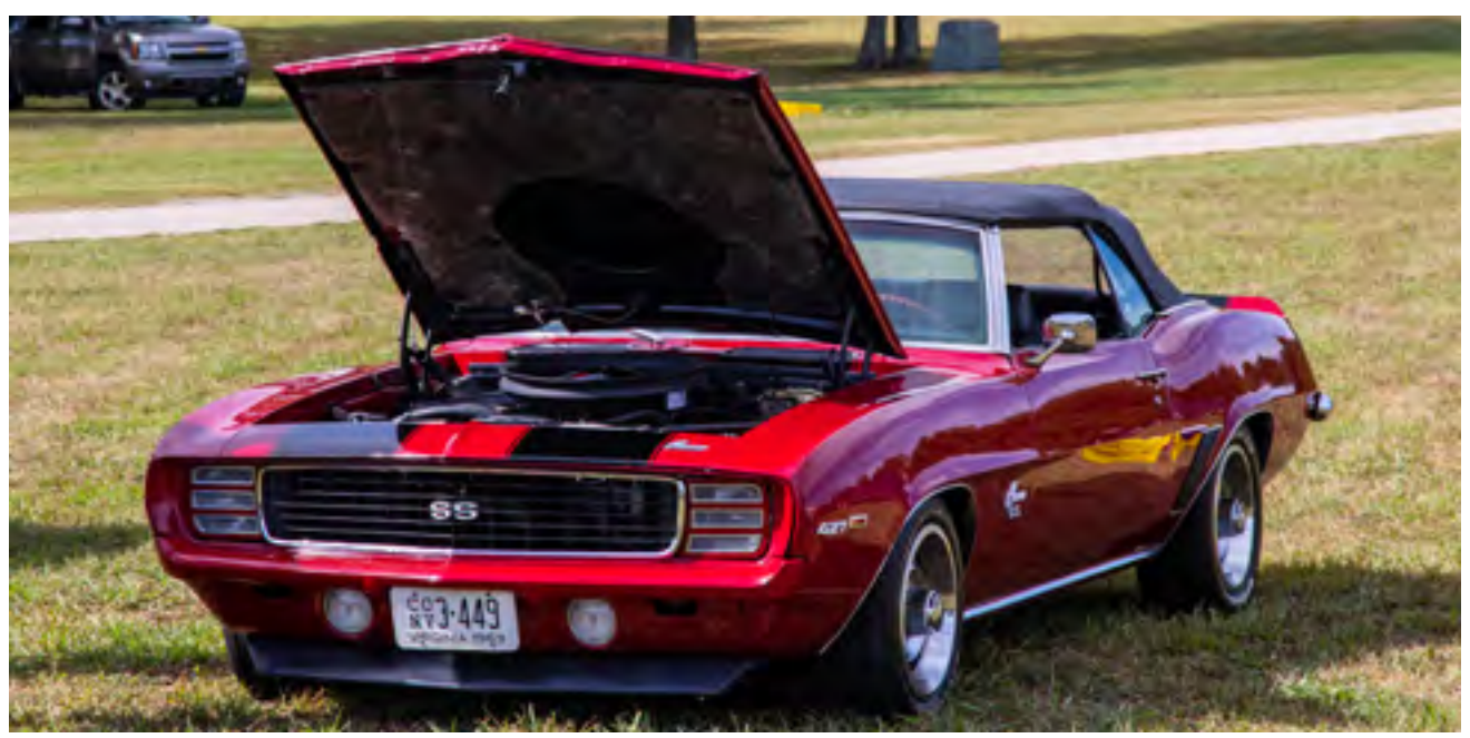
Hagerty Car Show, Virginia International Raceway. 1969 Camaro SS427 convertible. Canon 5D Mark IV, 24-105L at 105mm, ISO 200, F8.1 at 1/320 sec.