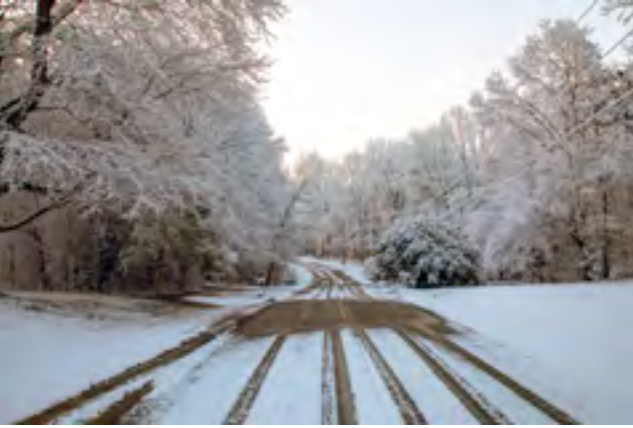
A light snowfall coats the trees, but leaves little on the road. Canon 5D Mark IV, 24-105L at 32mm, ISO 200, F9 at 1/25 sec.