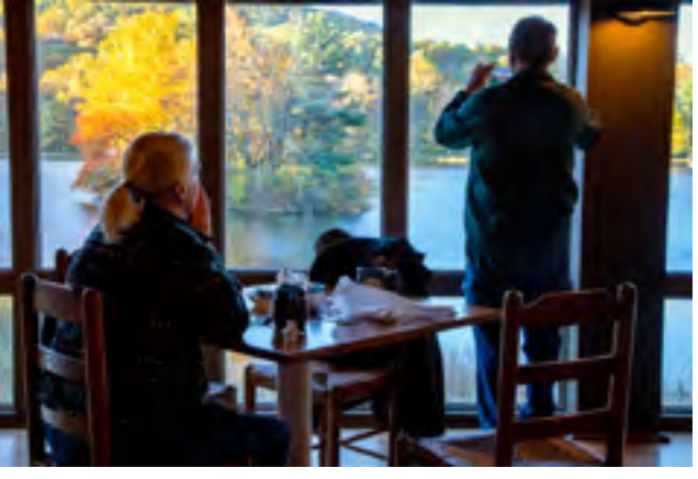
Though hard to see here, his phone display of the lake is visible in the original photo. Canon 5D Mark IV, 24-105L at 47mm, ISO 400, F9 at 1/10 sec.

Behind the restaurant building is Abbott Lake. The photographs are often the subject of articles and albums. A stiff wind and temperature of 39F degrees did not deter the several photographers we saw.