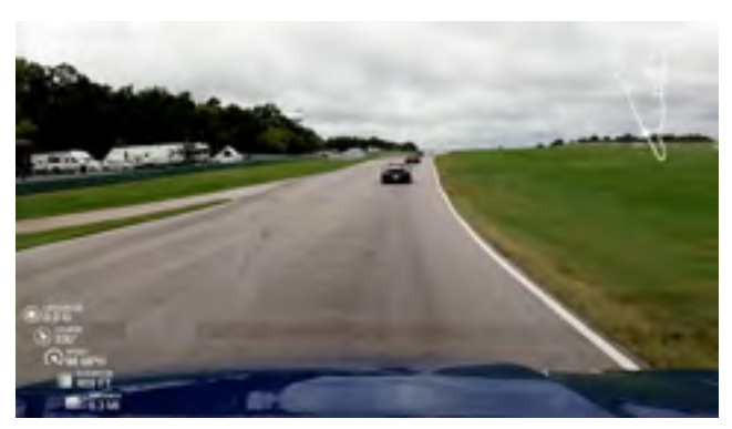
98\ \mathrm{mph} on the back straight at Virginia International Raceway. Garmin VIRB photo.