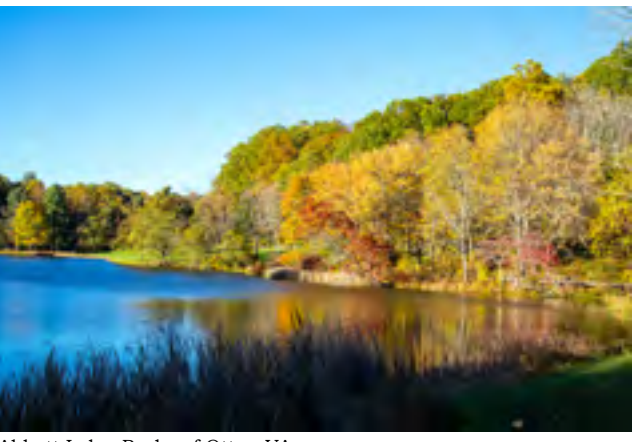
Abbott Lake, Peaks of Otter, VA. Canon 5D Mark IV, 24-105L at 40mm, ISO 200, F9 at 1/250 sec.