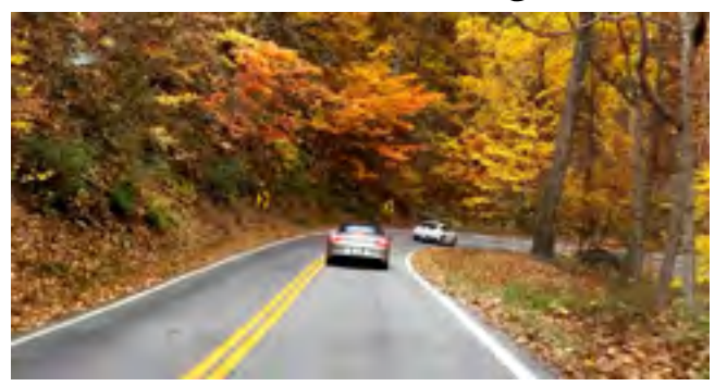
Fall leaves in full color graced out trip north.

The weather was dry with mostly cloudy skies. The road was cruising perfect. The scenery was fall finest. The pace was leisurely. All that made the drive to Natural Bridge perfect. No one was in a hurry, making this drive very relaxing. The absence of reds in the leaves