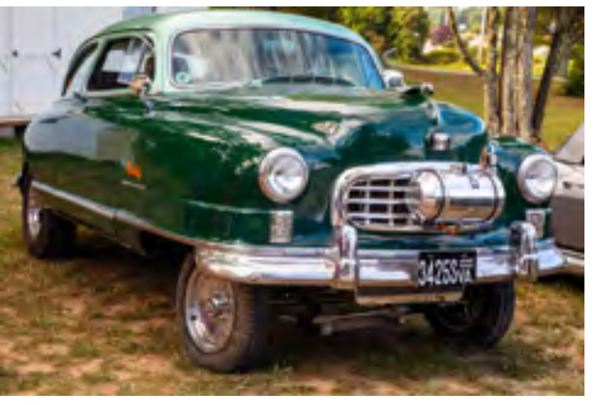
Lake Pipes cruise-in Moneta, Virginia. Nash gasser Canon 5D Mark IV, 24-105L at 65mm, ISO 100, F9 at 1/60 sec.