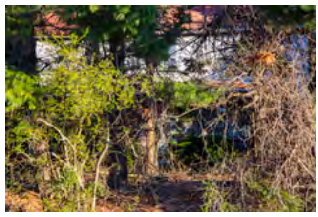
Abandoned house near Lynchburg, VA. That is where I fell in April. Canon 5D Mark IV, 24-105L at 105mm, ISO 100, F8 at 1/80 sec.