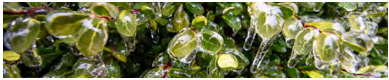
Close-up of ice covering the leaves of a shrub. Canon 70D, 10-18 at 10mm, ISO 100, F4.5 at 1/50 sec.