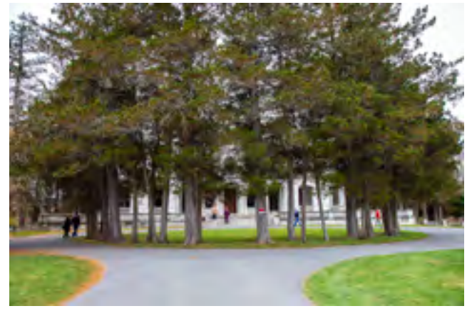
Sometimes you cannot see the house for the trees. Canon 5D Mark IV, 24-105L at 28mm, ISO 200, F6.3 at 1/50 sec.

Our group walked the grounds taking in the architecture and scenery. Others went inside to see the summer home opulence of a former generation.