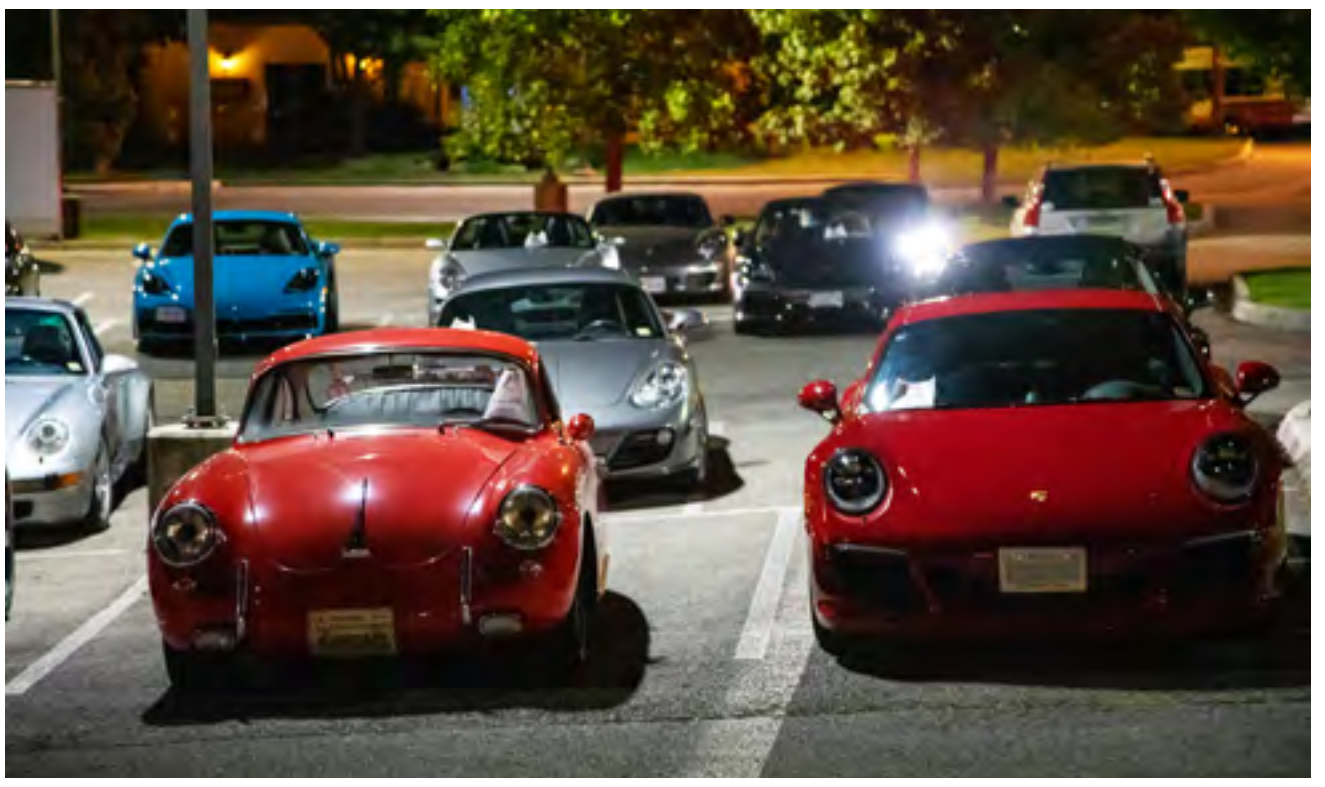
Night at a local Porsche club car show in Salem, Virginia. Canon 5D Mark IV, 24-105L at 93mm, ISO 12800, F4 at 1/40 sec.