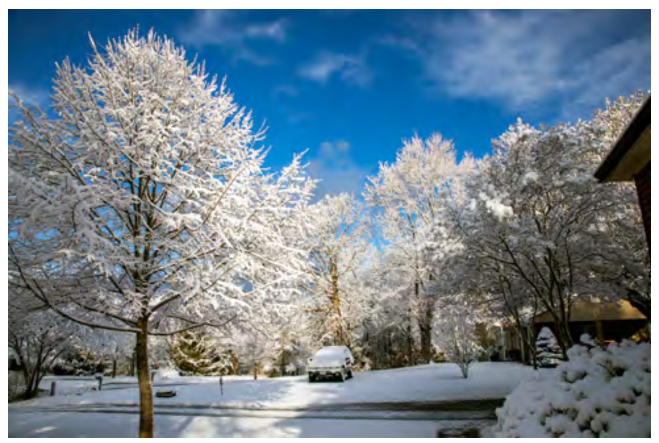
Early morning sun and blue sky give this photograph a dynamic effect increasing its beauty. Canon 5D Mark IV, 24-105L at 24mm, ISO 200, F11 at 1/640 sec.