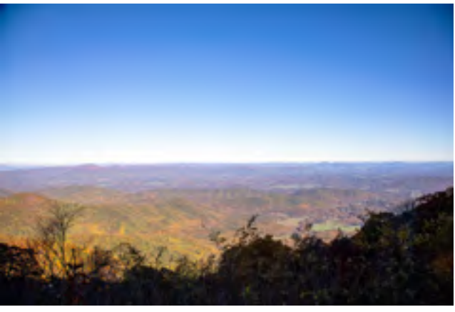
Fall colors from an overlook on, Blue Ridge Parkway, VA. Canon 5D Mark IV, 24-105L at 24mm, ISO 200, F9 at 1/500 sec.