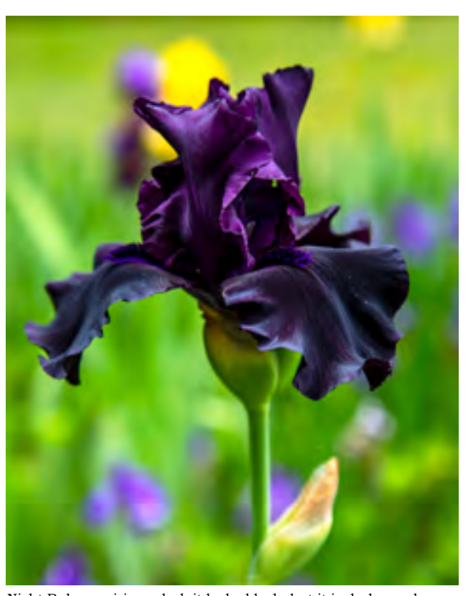
Night Ruler, an iris so dark it looks black, but it is dark purple. Canon 5D Mark IV, 24-105L at 82mm, ISO 200, F6 at 1/40 sec.