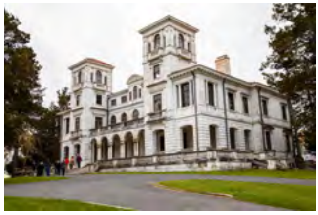
Side view from the front gives an idea of its large size. Canon 5D Mark IV, 24-105L at 35mm, ISO 200, F6.3 at 1/400 sec.