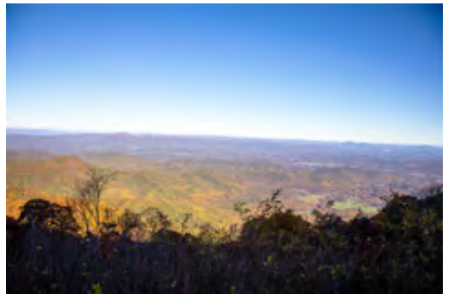
Fall colors from an overlook on, Blue Ridge Parkway, VA.. Canon 5D Mark IV, 24-105L at 24mm, ISO 200, F9 at 1/500 sec.