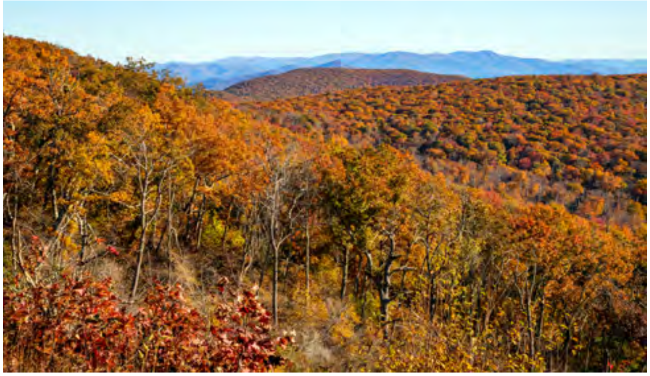
Fall colors from an overlook on, Blue Ridge Parkway, VA. Not many reds in 2021, but colorful nonetheless. Canon 5D Mark IV, 24-105L at 58mm, ISO 200, F9 at 1/200 sec.