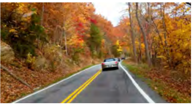
Fall leaves in full color graced out trip north.

The weather was dry with mostly cloudy skies. The road was cruising perfect. The scenery was fall finest. The pace was leisurely. All that made the drive to Natural Bridge perfect. No one was in a hurry, making this drive very relaxing. The absence of reds in the leaves