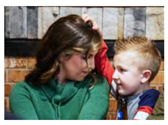
My niece and great nephew, a mother's love. Canon 5D Mark IV, 24-105L at 105mm, ISO 12800, F4 at 1/60 sec.