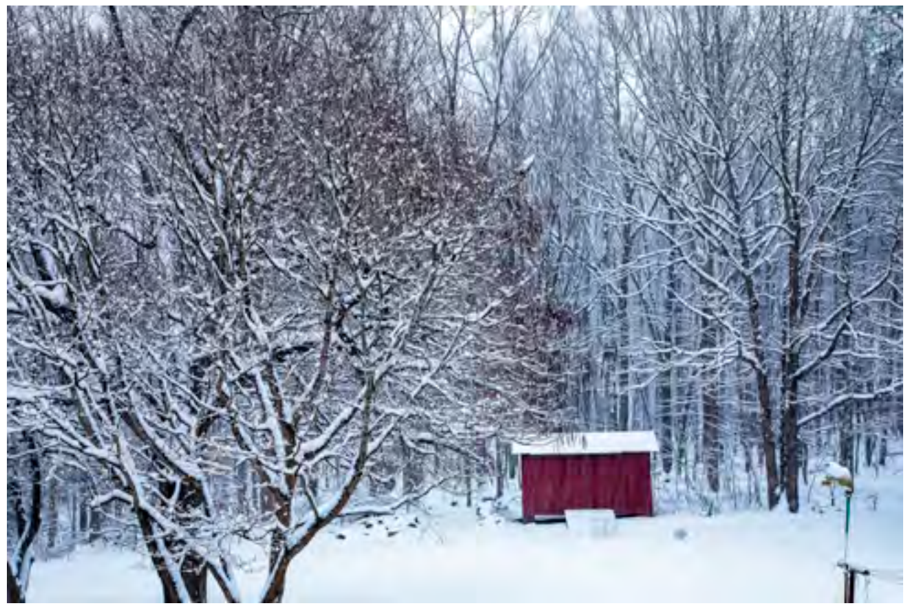
Though hard to see, the snow is still falling as seen against the dark red building. Canon 5D Mark IV, 24-105L at 55mm, ISO 320, F16 at 1/4 sec.