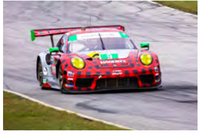
The #9 Pfaff Motorsports Porsche GT3 R won the GTD class. Canon 5D Mark IV, 100-400L at 400mm, ISO 125, F7.1 at 1/320 sec.