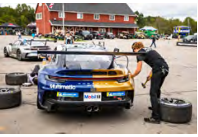
When all else fails, get a bigger hammer. Canon 5D Mark IV, 24-105L at 28mm, ISO 400, F8 at 1/500 sec.