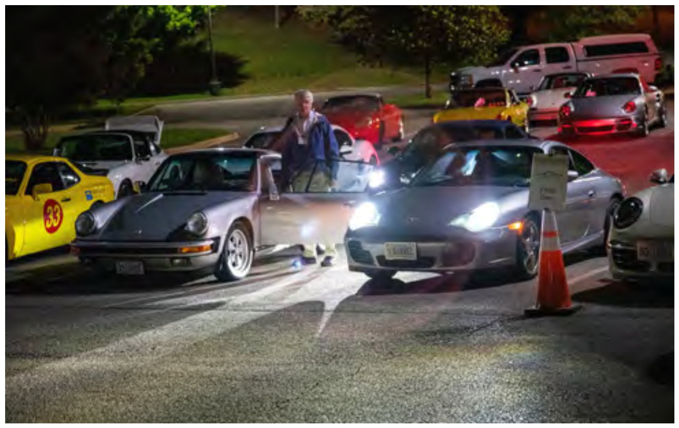
Night at a local Porsche club car show in Salem, Virginia. Canon 5D Mark IV, 24-105L at 80mm, ISO 6400, F4 at 1/60 sec.