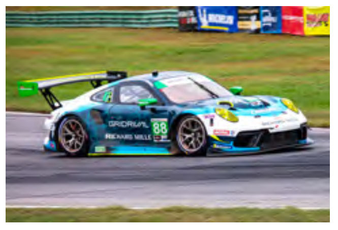
The #88 Team Hardport Porsche 911 GT3.R Canon 5D Mark IV, 100-400L at 275mm, ISO 200, F7.1 at 1/500 sec.