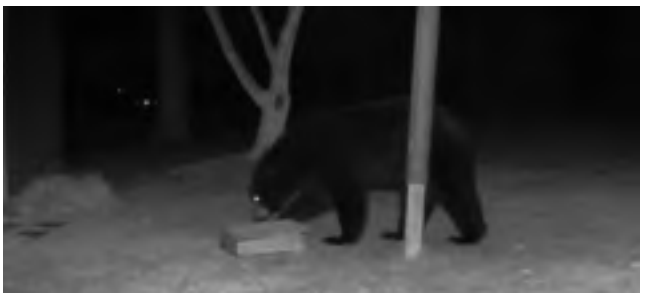
This bear destroyed the bird feeder in my back yard. Trail camera photo.