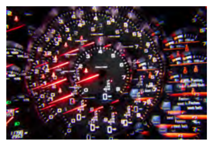
Automobile gages, lit and engine running. Canon 5D Mark IV, 24-105L at 45mm, ISO 500, F4 at 1/2 sec.

The photographs on this page were taken with a prism filter installed. Being creative is vitally important with that filter. The different effects of the filter vary with subject distance and filter rotation position. Do you like the effect?