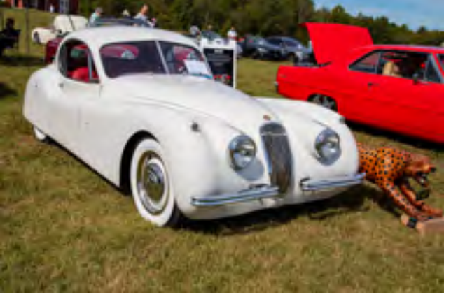
Hagerty car show in Alton, Virginia. 1953 Jaguar Canon 5D Mark IV, 24-105L at 40mm, ISO 200, F8 at 1/1250 sec.