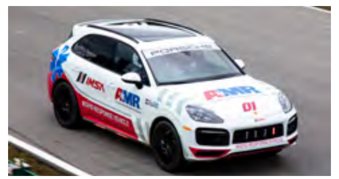
The VIR Rapid Response Vehicle passes under the start stand headed for an incident.

Canon 5D Mark IV, 24-105L at 105mm, ISO 200, F7.1 at 1/320~{\rm sec.}