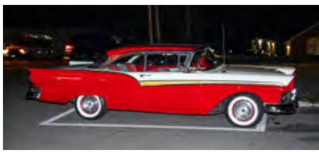
Night shot of a restored 1957 Fairlane 500 in Lynchburg, VA. Canon 5D Mark IV, 24-105L at 50mm, ISO 1600, F4 at 1/60 sec.

A variety of photographs from different places and dates adorn these pages. I really love candid shots, which these are. I often take my camera with me just in case a photo op presents itself. You cannot get the shot if the camera is left home.