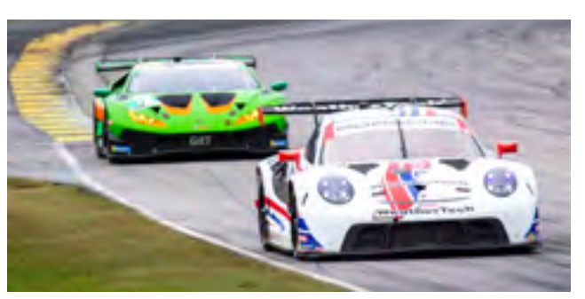
The #79 Weather Tech Porsche RSR-19 keeping the #19 GRT Grasser Racing Team Lamborghini Huracan GT3 EVO behind. Canon 5D Mark IV, 100-400L at 400mm, ISO 125, F7.1 at 1/320 sec.