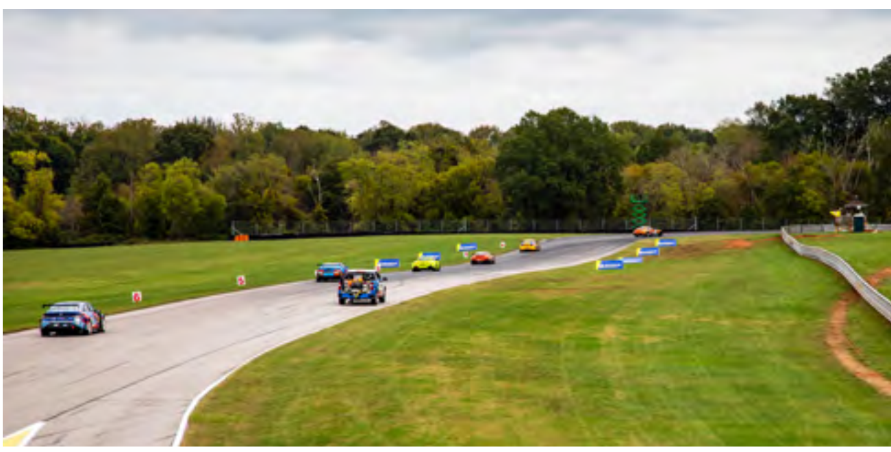
Full course caution brings out the safety vehicles. Photo looking toward the Horse Shoe. Note the yellow flag at the corner. Canon 5D Mark IV, 24-105L at 105mm, ISO 200, F7.1 at 1/320 sec.

Canon 5D Mark IV, 24-105L at 105mm, ISO 200, F7.1 at 1/320~{\rm sec.}