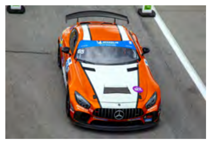
The #65 Murillo Racing Mercedes-AMG GT GT4 leaves the pits and heads back onto the track. Canon 5D Mark IV, 24-105L at 105mm, ISO 200, F7.1 at 1/320 sec.