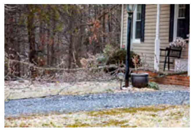
Ice sends a maple branch dangerously close to the house. Canon 5D Mark IV, 70-200L at 200mm, ISO 200, F10 at 1/100 sec.

Winter weather is cold, dark, and ugly. That is until there is snow or ice around. Sparkling ice, snow falling, and sunshine create many beautiful photographs. The opportunities are endless for creativity and different perspectives. Take time to look