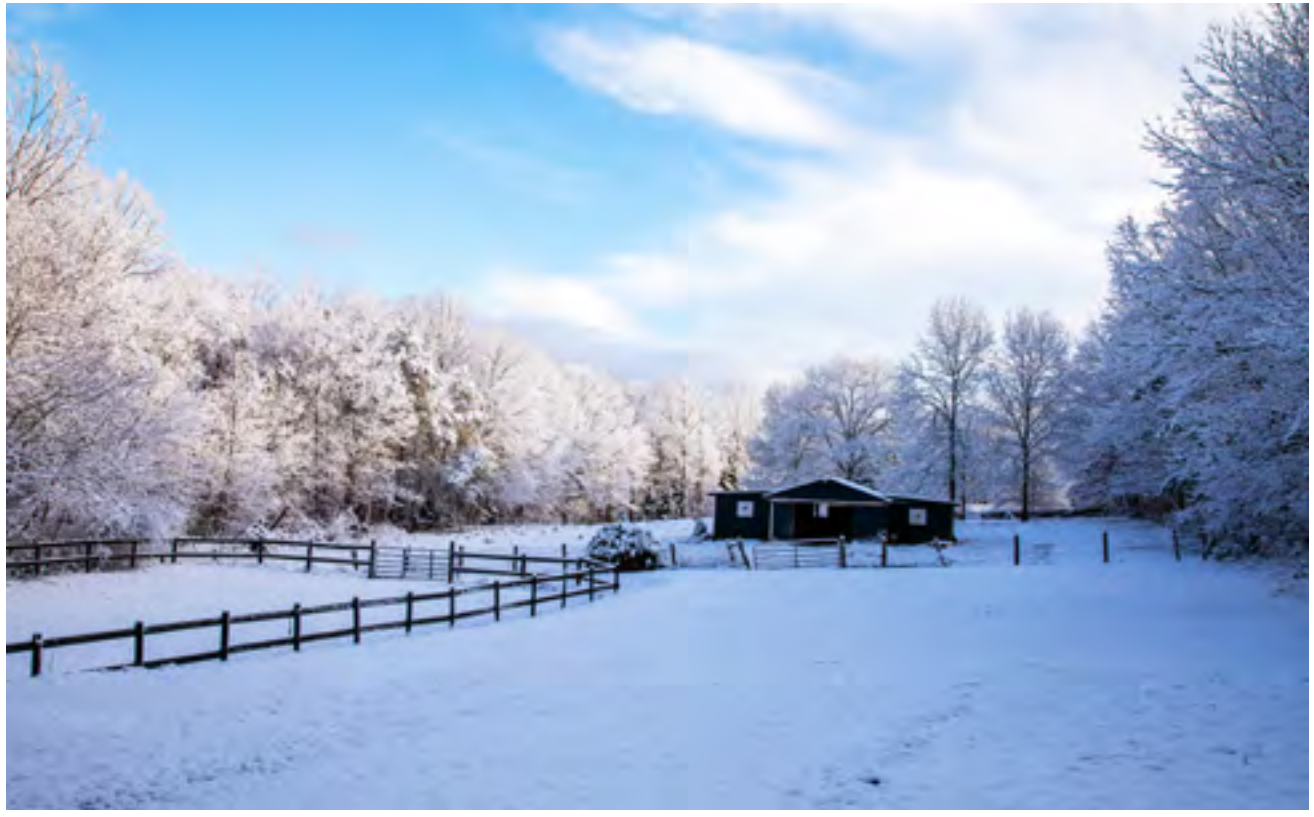
Barn, riding ring, and pasture lit by the early morning sun Canon 5D Mark IV, 24-105L at 35mm, ISO 200, F11 at 1/500 sec.