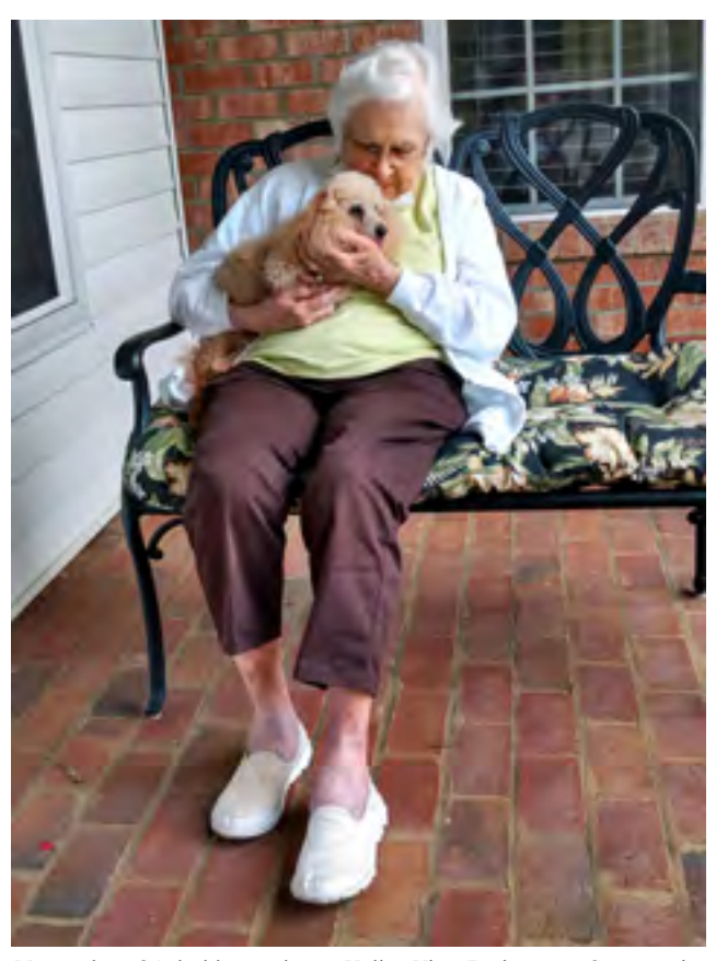
My mother, 94, holds my dog at Valley View Retirement Community in Lynchburg, VA. \,\