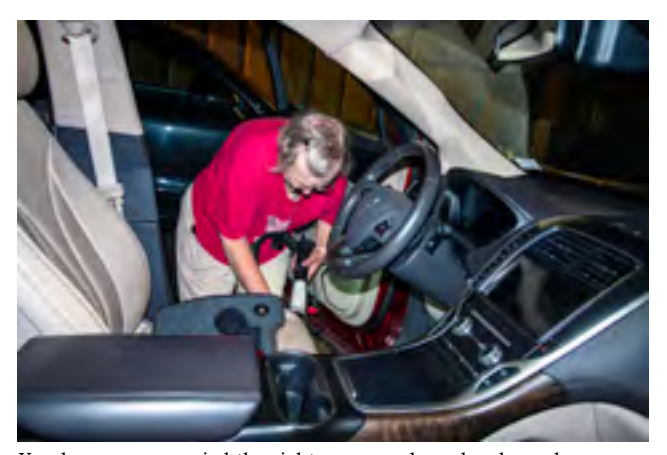
You know you married the right woman when she cleans her car. Canon 70D, 10-18 at 18mm, ISO 400, F5.6 at 1/60 sec.