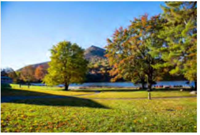
Sharp top across from Abbott Lake, Peaks of Otter, VA. Canon 5D Mark IV, 24-105L at 24mm, ISO 200, F9 at 1/160 sec.