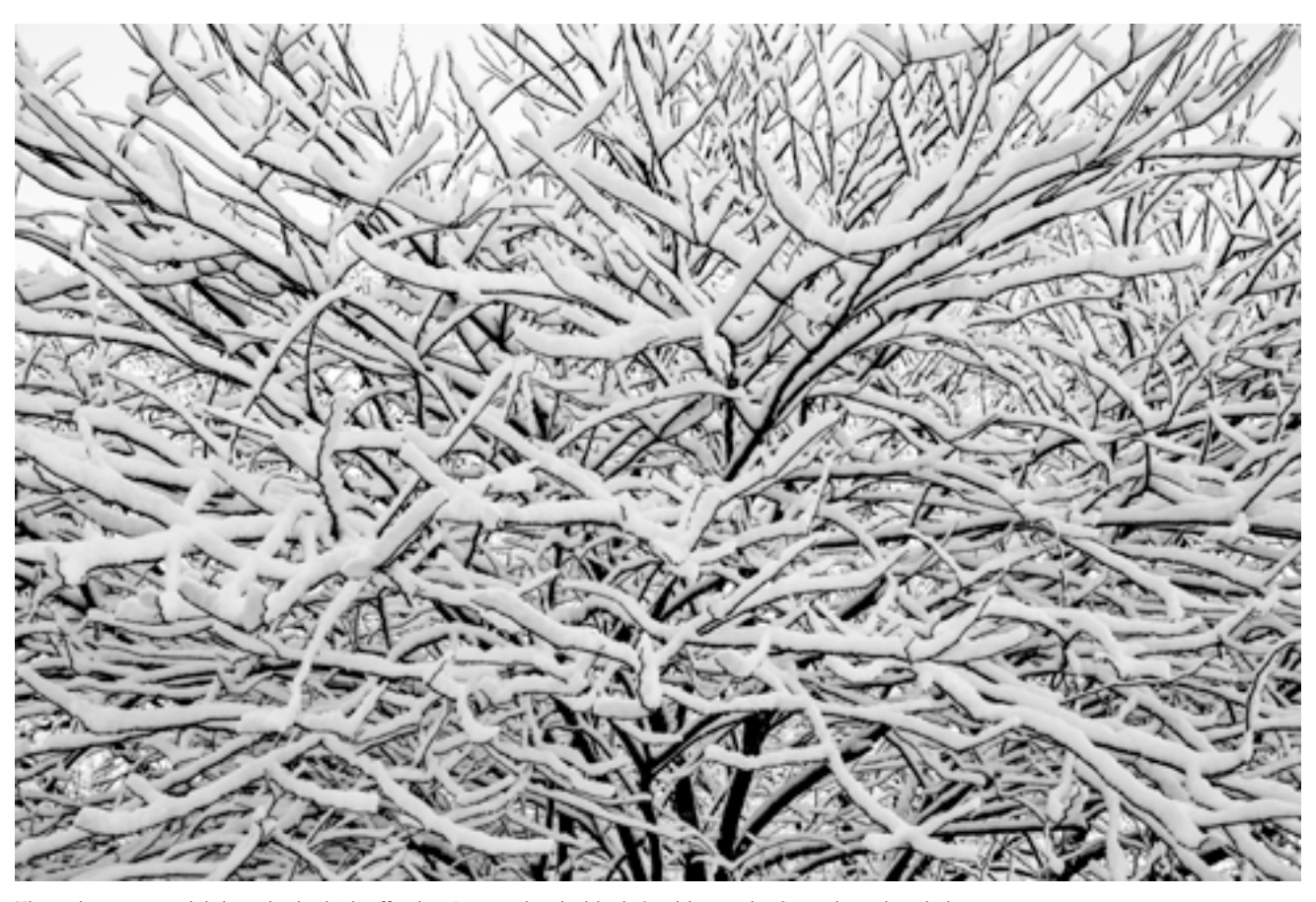
The only camera trick here is the lack off color. It was shot in black & white mode. Sometimes less is better. Canon 5D Mark IV, 24-105L at 75mm, ISO 200, F9 at 1/30 sec.