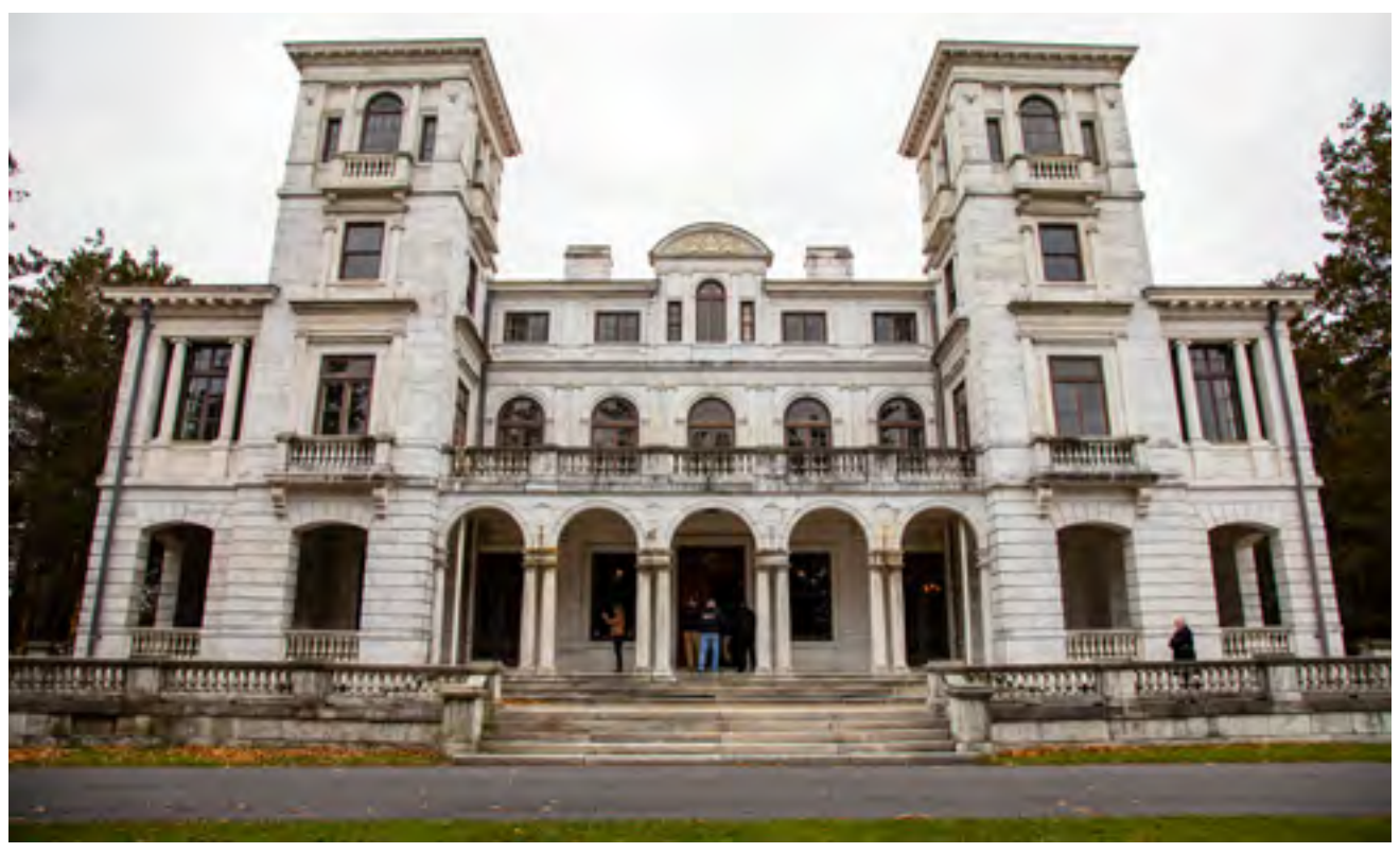
The front of the house, built as a summer home. The main home is in Richmond, VA Canon 5D Mark IV, 24-105L at 24mm, ISO 200, F6.3 at 1/400 sec.