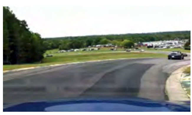
The Roller Coaster at Virginia International Raceway. Garmin VIRB camera

Being last in line, and at highway speeds, the Macan had no trouble keeping up with the cars. It is strange to see SUVs on the track, even at slow speeds. But we know Porsche SUVs are a breed all their own. And while they cannot compete with Porsche cars, they still give great driving experiences.