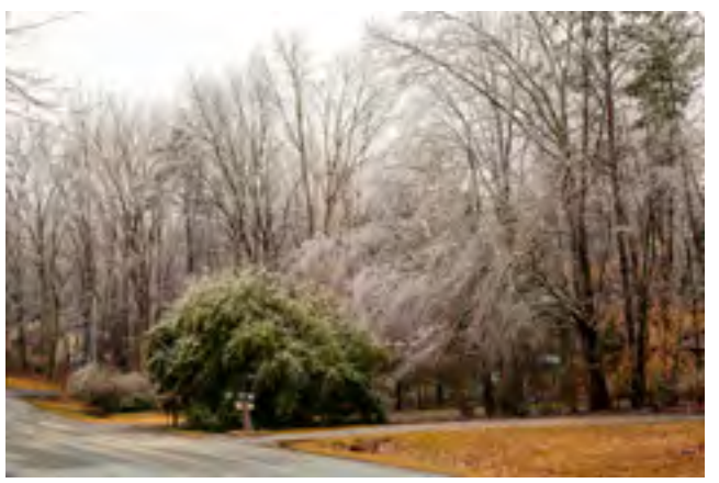
Ice on trees and shrubs is beautiful but deadly to drivers. Canon 5D Mark IV, 24-105L at 60mm, ISO 200, F13 at 1/60 sec.