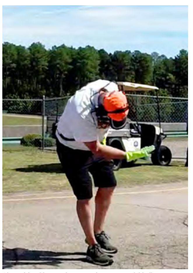
Please drive this way, the racetrack course martial indicates. Garmin VIRB photo. \,

A variety of photographs from different places and dates adorn these pages. I really love candid shots, which these are. I often take my camera with me just in case a photo op presents itself. You cannot get the shot if the camera is left home.