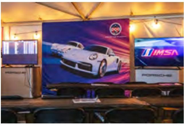
Before the weekend events began, the hospitality tent was ready and waiting. Canon 5D Mark IV, 24-105L at 105mm, ISO 8000, F4 at 1/150 sec.

- Porsche Carrera Cup. Sunday morning another busy day began with qualifying for the Michelin Challenge TCR series, followed by qualifying for the Michelin Challenge GS series. Later in the morning the much awaited Porsche Parade Lap registration and mandatory IMSA Parade Lap Safety Briefing were held. The afternoon began with race #2 - Porsche Carrera Cup, and a IMSA Hot Pit Experience raffle. Porsche parade laps were held with only one Porsche SUV, the rest being Porsche cars. The last event was the IMSA Michelin Pilot Challenge. It was a very interesting and busy weekend. Lets do it again next year.